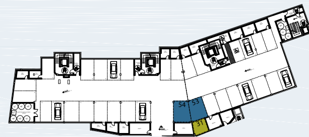
GARAGE AND STORAGE LOCATION (LEVEL +29,25M)