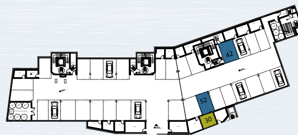
GARAGE AND STORAGE LOCATION (LEVEL +29,25M)