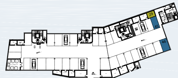
GARAGE AND STORAGE LOCATION (LEVEL +29,25M)