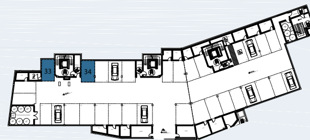
GARAGE AND STORAGE LOCATION (LEVEL +29,25M)