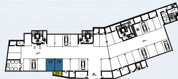
GARAGE AND STORAGE LOCATION (LEVEL +29,25M)