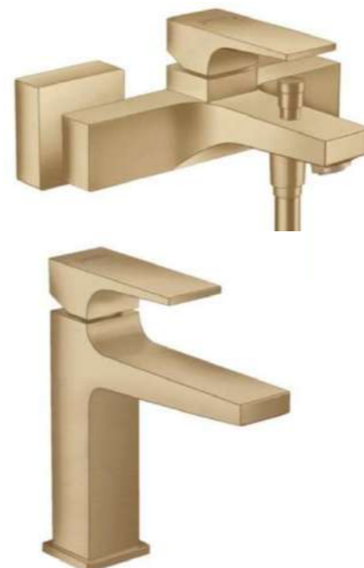
Secondary bathrooms taps.