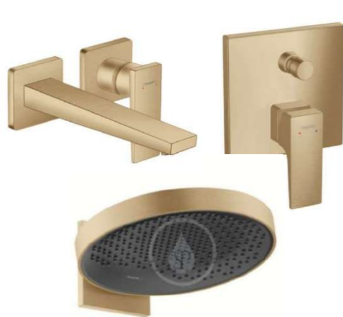
Master Bathroom Taps

Backlit mirrors Fanti-slip floor integrated shower tray. Full size sliding shower screen. Wall mounted toilet, concealed in wall tank, dual-flush actuator medium and complete discharge. Soft close toilet seat.